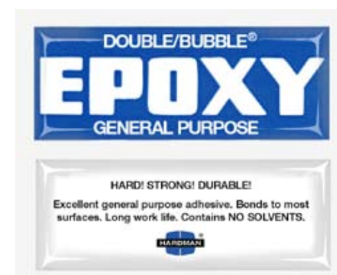
Double/Bubble ® General Purpose Epoxy • A long work-life adhesive • For bonding wood, metal, ceramics, concrete, rubber & plastics P/N 74497