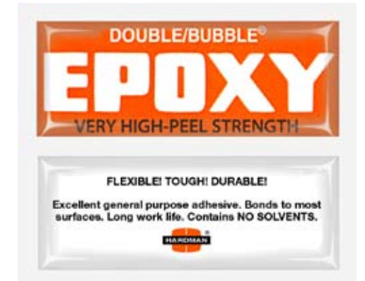
Double/Bubble ® High Peel Strength Epoxy • A flexible, tough & durable, vibration resistant adhesive • High peel and shear strengths • Bonds to polystyrene, ABS nylon, metal, wood, masonry and rubber P/N 74496