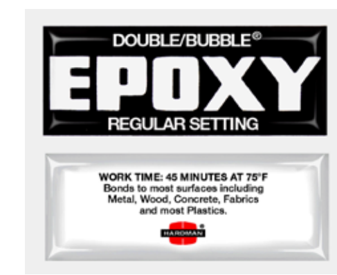
Double/Bubble ® Regular Setting Epoxy • A low-viscosity adhesive • Fairly long work-life • Cures to a light color • Bonds well to wood, metal, concrete, fabrics and most plastics P/N 74493