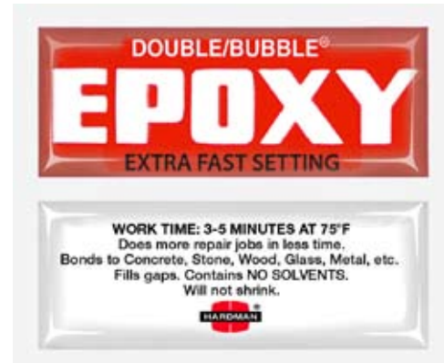
Double/Bubble ® Epoxy Extra Fast Setting • Extra fast setting for quick repairs • For bonding wood, glass, metal, stone, concrete, ceramics & leather P/N 74499