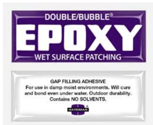
Double/Bubble ® Wet Surface Patching Epoxy • A gap-filling adhesive for use in damp or moist environments • Cures and bonds under water • Bonds to stone, concrete, metal, glass, china, wood and fiberglass P/N 74495