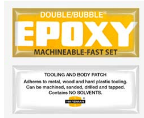
Double/Bubble ® Machineable Epoxy • Machineable tooling and/or body-patching adhesive • Adheres to metal, wood and hard plastics • Can be machined, sanded, drilled and tapped P/N 74498