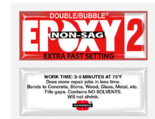
Double/Bubble ® Extra Fast Set (Non-Sag) Epoxy • Extra fast setting • Non-sag (thixotropic) adhesive • For quick repairs • Bonds to wood, glass, metal, stone, ceramics and leather P/N 74492