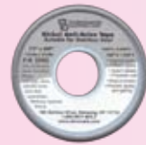
Nickel P/N 32903