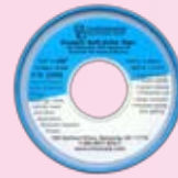
Ceramic P/N 32904