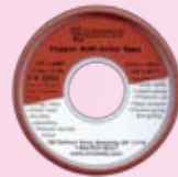
Copper P/N 32902